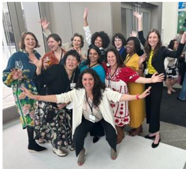
Greater Giving Summit, Gates Foundation, Seattle, April 2023